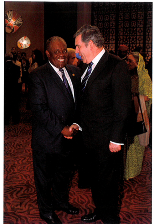
The Rt. Hon. Hubert Ingraham and Prime Minister Gordon Brown at the CHOGM 2009 hosted by Trinidad and Tobago.